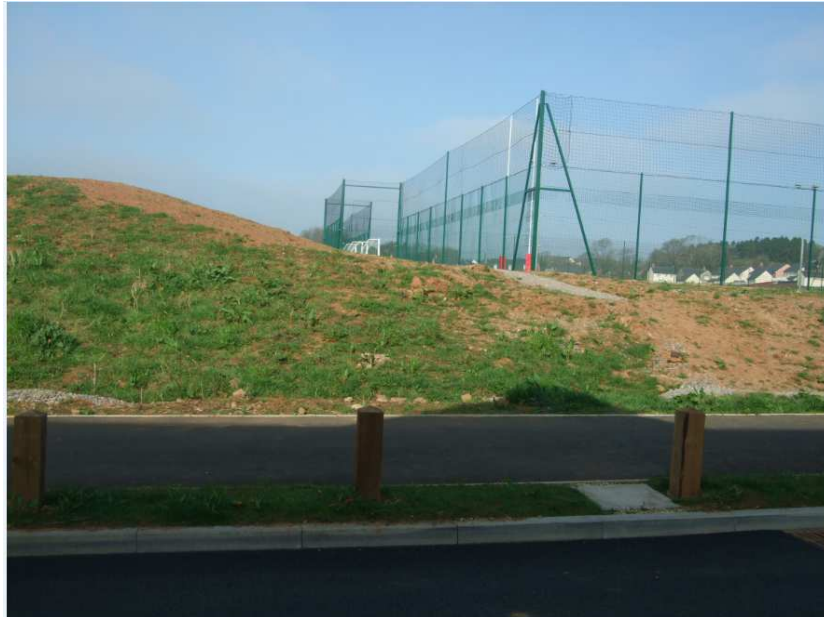
Photograph showing land levels in relation to the MUGA. (April 2018)

The variation of condition application included a plan showing spot heights across the area of land to the south of the MUGA and included the finished floor levels of the properties in Trem Y Llwyfen facing onto this site. From a review of that plan it was evident that land levels adjacent to the southern boundary of the MUGA increased between approximately 1m-1.8m over a distance of 16m.