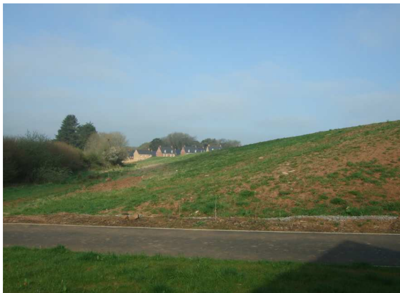
Photograph show slope from top of mound to hedgerow (April 2018)

Further to the south, the land levels fall more steeply by 6.8m over a distance of approximately 31m down to the hedgerow, which marks the northern boundary of the footpath.