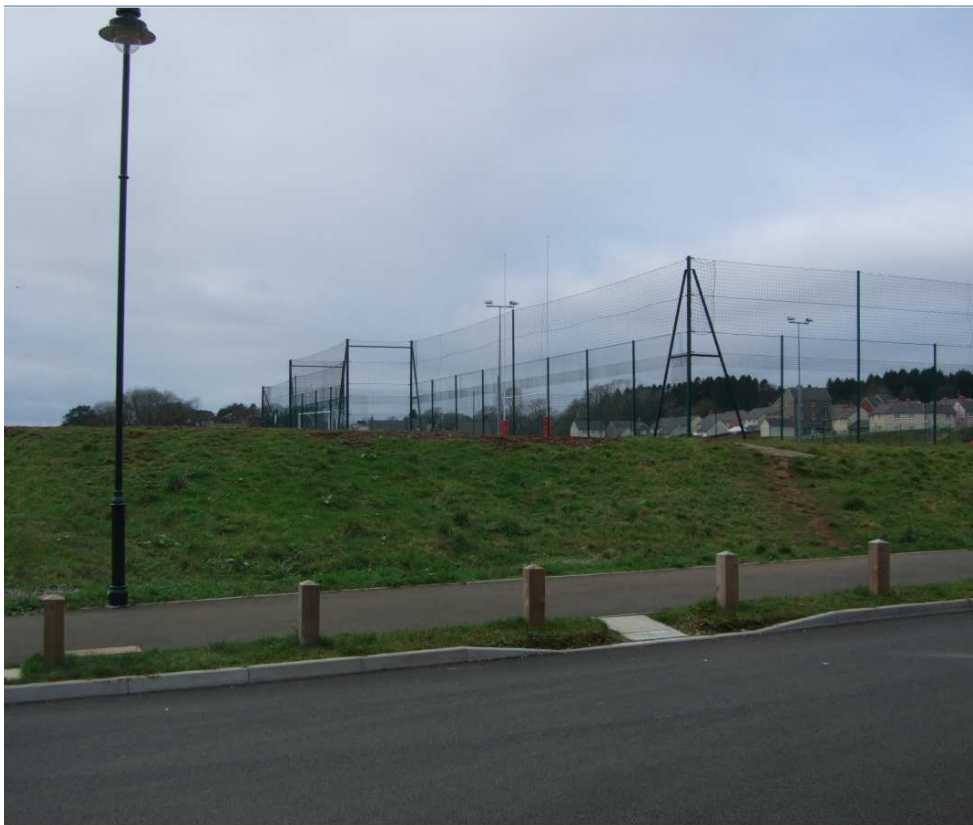
Photograph showing land levels (January, 2019)

Since that time further earth works have been undertaken, which have removed the mound on the southern side of the MUGA and effectively spread the material westwards. The following photograph shows the current levels that have been created.