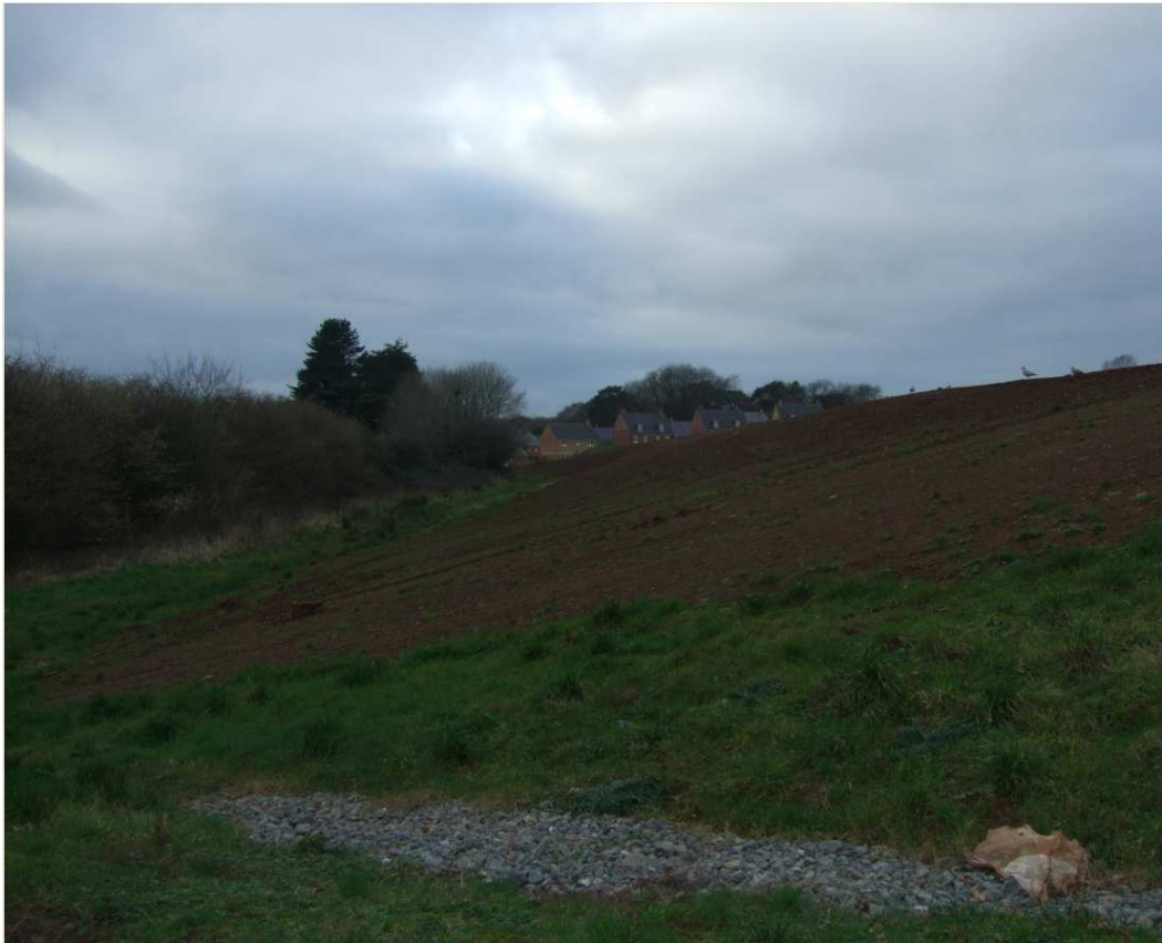
Photograph show slope from top of mound to hedgerow

It will also be evident from this photograph and the following image taken from the top of the earthworks looking towards the properties in Trem Y Llwyfen that no landscaping of the area has been undertaken and the area is currently bare earth.